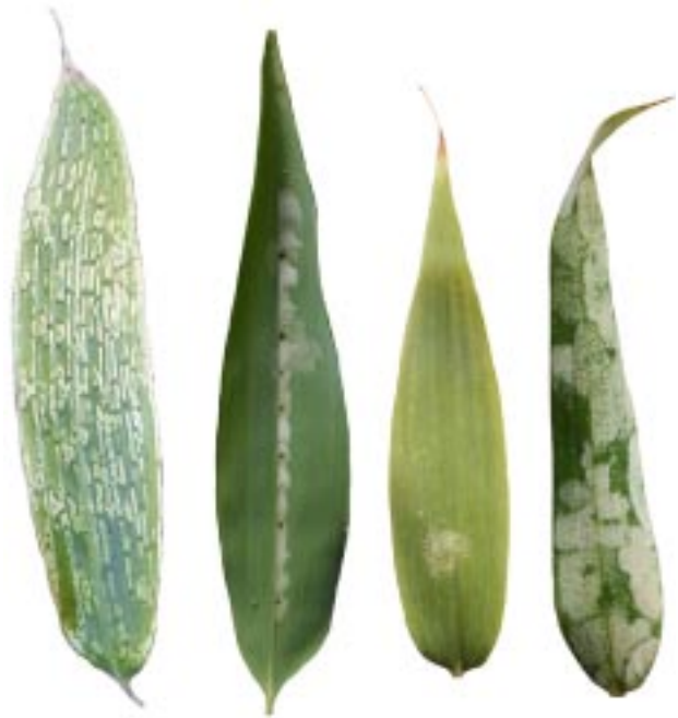
Figure 3. Variations in spider mite damage on bamboos.

The mites pierce individual plant cells on the underside of the leaf and suck out the cell contents causing the discoloration on the upper leaf surface (Evans, 1992). Heavy infestations can cause green bamboos to appear yellow-green in