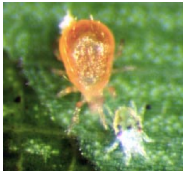
Figure 4. Predatory mite, Galendromus helveolus attacking bamboo spider mite

Because of the low aesthetic threshold, growers should regularly monitor bamboo for the presence of bamboo spider mites and release predatory mites as soon as bamboo spider mites are discovered. Commercial bamboo growers must carefully consider the advantages and disadvantages of a biological control program or develop an integrated pest management (IPM) approach that best suits their needs. While some prey must be present for biological control to succeed, plants must be free of all mites prior to transportation from nursery.