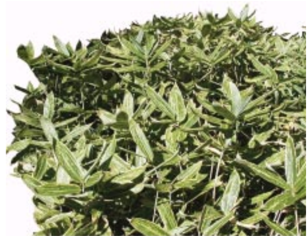
Figure 1. Sasa veitchii severely infested with bamboo spider mites.

A newly formed web nest is composed of a single translucent layer and the mites can be seen beneath the webbing. Bamboo spider mites spend most of their time under this webbing but occasionally venture out and scuttle about on the underside of the leaves. Eventually all life stages exist beneath a single web nest (Fig. 2). As the colony ages, successive overlapping sheets